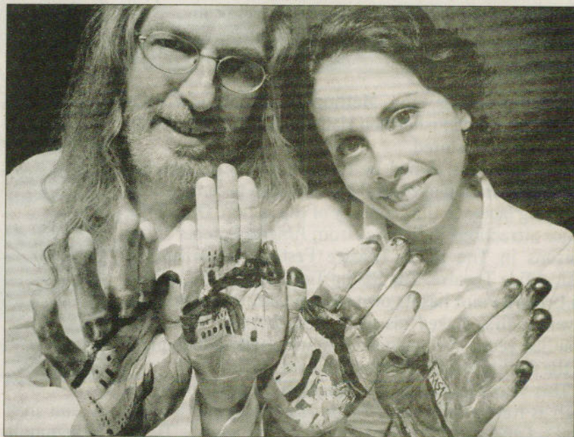
RASA perform two tunes on the Our Songs compilation CD.